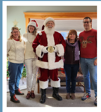
Santa Day Volunteers