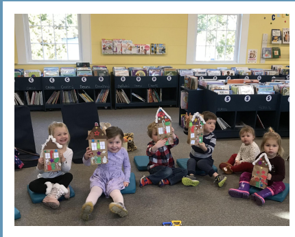
Storytime: Gingerbread Baby Traps