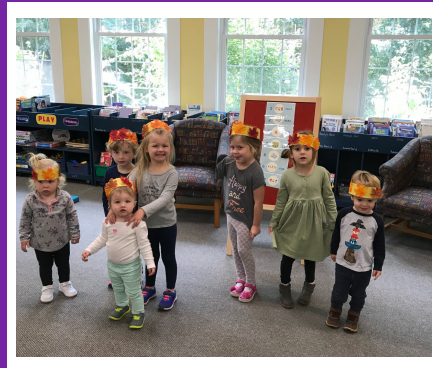
Storytime Autumn Crowns